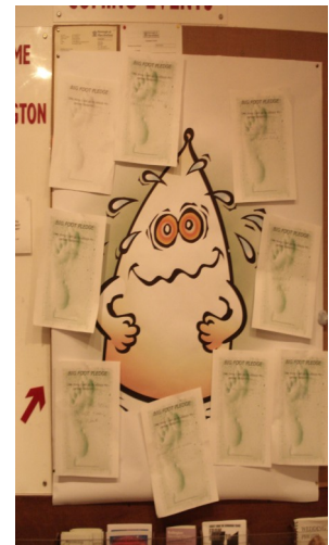
Some of the green foot pledges made at the Arts Centre event